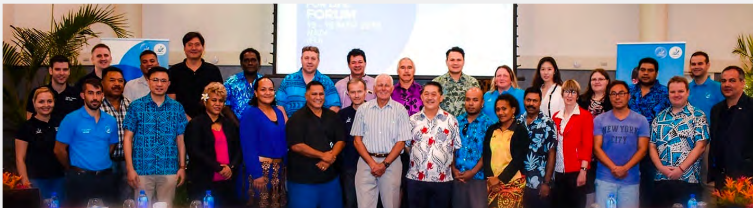
ITTF-Oceania will hold its AGM on Saturday 22 August.

New territory for continental Annual General Meetings (AGM), ITTF-Oceania will break new ground on Saturday 22 August, hosting the first AGM by a continental federation in a new digital form with online voting procedures.