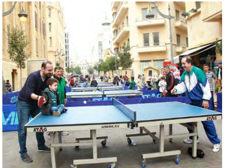
The ITTF stands with the people of Lebanon through this difficult time.

Having evaluated the situation, paying close attention to Lebanon's table tennis community, a sum of USD 30,000 has been donated towards projects designed to re-activate table tennis in the nation, using the sport for positive social outcomes. The funding derives from the donations received for the #TableTennisUnited donation campaign, after the grant panel approved this as an exceptional use with incoming donations significantly higher than the applications received. READ MORE